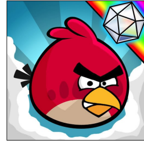
Top App Right Now!